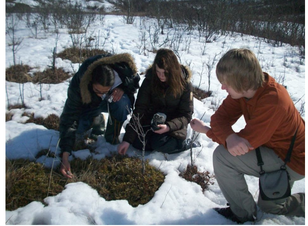
Students observe medicinal plants peeking through the snow