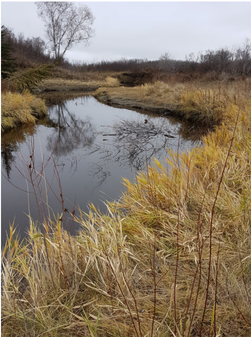
Brightwater Creek Oct 2016

The Middle Years program is based out of the Salvation Army Beaver Creek Camp full-service facility. Multi-day experiences lease cabins, kitchen, and hall facilities through an ongoing partnership between SPS and the Salvation Army. (See fee schedule below).