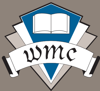
WALTER MURRAY COLLEGIATE