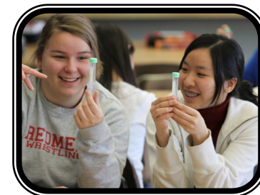
IB Diploma Class of 2012 students in IB Biology examining their DNA extractions!