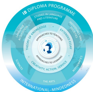
IB Diploma Programme Model

Over a two year period, IB Diploma students study six academic subjects, one from each group on the program model, although a second group 2-4 subject may supplant group 6.